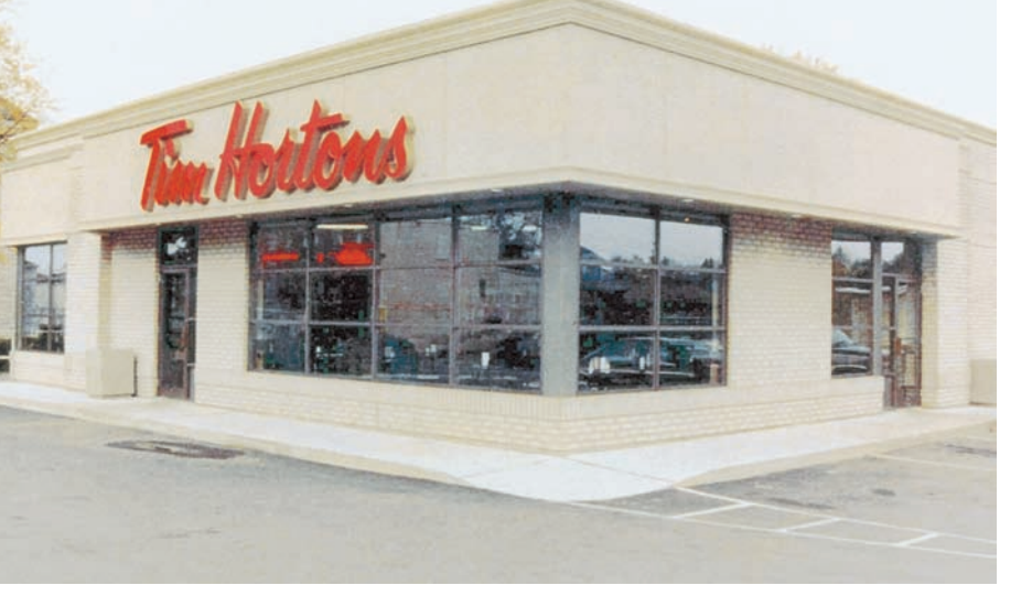
Many chains are synonymous with well-known brand names.

time today when established food service giants struggle with each other over a much more slowly growing market.