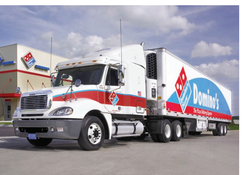
A good location is an important element of marketing.

Today's customers live harried and hurried lives. Whether members of a twoworking-spouse family or a single-parent family, adults (and, increasingly, children) today see themselves as being constantly rushed. The tendency is to fit meals in wherever they happen to be, to "grab a bite," as the phrase has it, "on the run." Effective