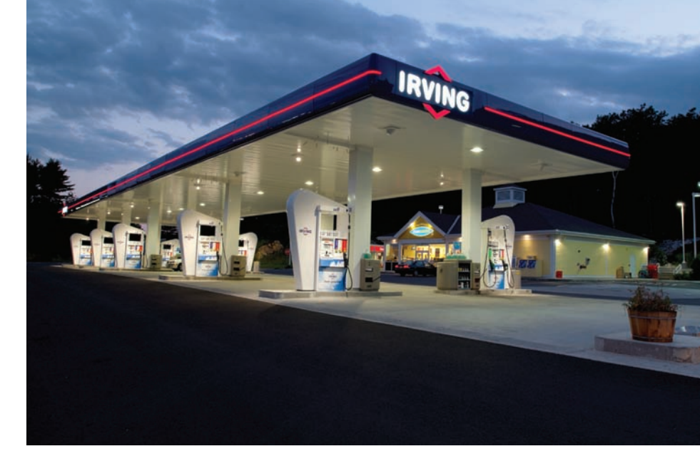
Convenience stores continue to compete with quick-service restaurants.

Food service now accounts for the third largest category of convenience store sales, after cigarettes and packaged beverages.