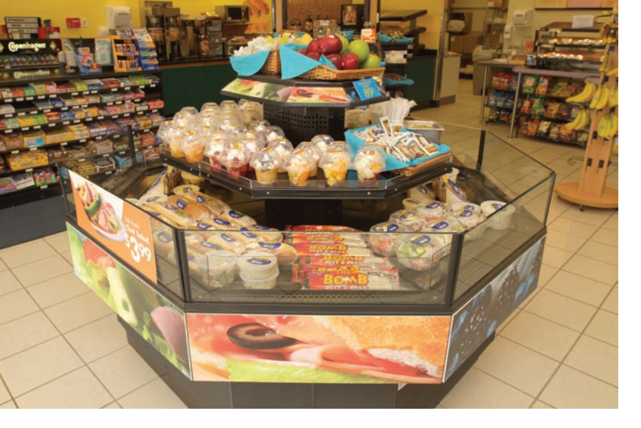
By offering a larger selection of prepared foods and attractive seating areas, grocery stores are increasing their share of the food service market.

formidable competitors for the food dollar. A state-of-the-art store today emphasizes food service, and many grocery stores are adding food courts and full-scale restaurants, including ethnic-themed operations as well as brand-name QSRs. McDonald's, Burger King, Pizza Hut, and Taco Bell all operate units in supermarkets, and contract companies such as ARAMARK have developed branded programs for supermarkets. We discussed the proliferation of PODs earlier, and here we can see it as a part of the blurring of concepts. When is a restaurant "sort of not exactly" a restaurant? When it's part of a grocery store offering food service. Or perhaps we should just say that grocery stores are a very significant part of the ever-increasing competition for the consumer's food dollar.