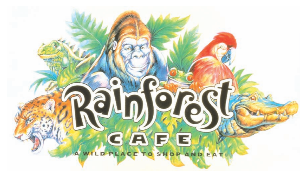
A brand name helps to heighten the guest's awareness of the product.

Sometimes it is not just one product but an entire concept that is adopted in a joint location. Miami Subs needed a way to strengthen its weak day parts. Rather than invent and promote a new product of its own, the company added Baskin-Robbins ice cream and frozen yogurt, which sold well in the otherwise slow late-afternoon and late-evening day parts. Other companies have reached similar arrangements, including Baskin-Robbins and Subway.